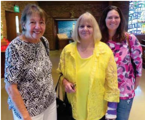
Photos from July 8/9 Weekend Masses